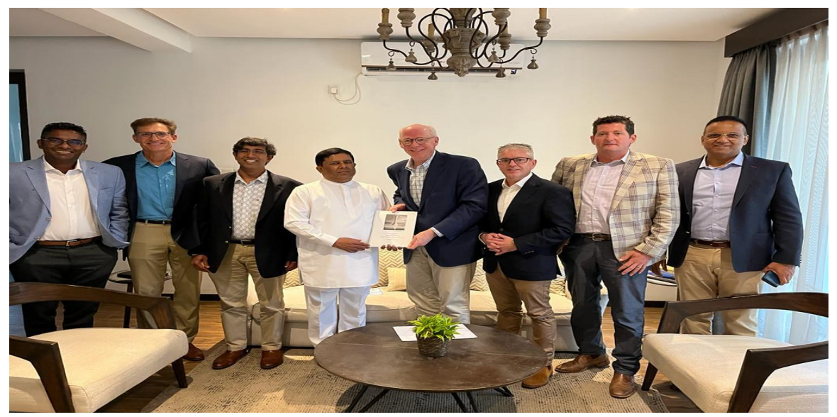
Image 2. Delegation meeting with the Minster of Home Affairs, Mr Vajira Abeywardena

Sri Lanka currently relies on a generation mix of hydroelectric power, oil and diesel and coal generation for its source of power with renewables generating a fraction of the generation mix.